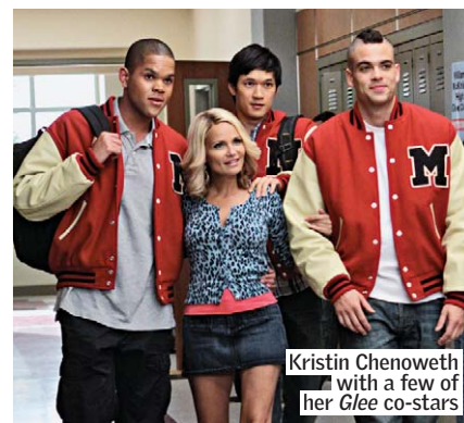
Kristin Chenoweth with a few of her Glee co-stars