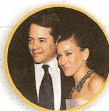
Sarah Jessica Parker & Matthew Broderick

TC: Oh, Gwyneth. What a loss. You could have had Brad. What were you thinking? She's going to get bored. She's going to want the career back. CN: Chris and Gwyn named their child Apple; when you ensure that a child will be ridiculed for the rest of her life, you are obligated to stay together and share the blame equally. PP: Both of them grew up with happily married parents, and they quickly followed up their first baby's birth with another pregnancy. Something must be going right.