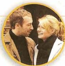
Gwyneth Paltrow & Chris Martin