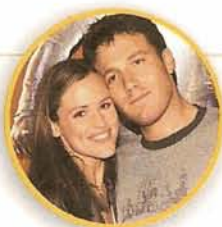
Jennifer Garner & Ben Affleck