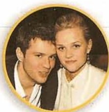
Reese Witherspoon & Ryan Phillippe

TC: With the baby, I give it maybe an extra six months. I think she'll jump eventually. And then Ben is going to have to go back to work. His career was dating famous women. CN: It's Bennifer Two! And everyone knows that 2005 was the year for better sequels. PP: The two of them have dubious relationship histories, but they seem to be low-key and on track together. JR: I give Ben and Matt Damon better odds at lasting love than I give Ben and Jennifer.